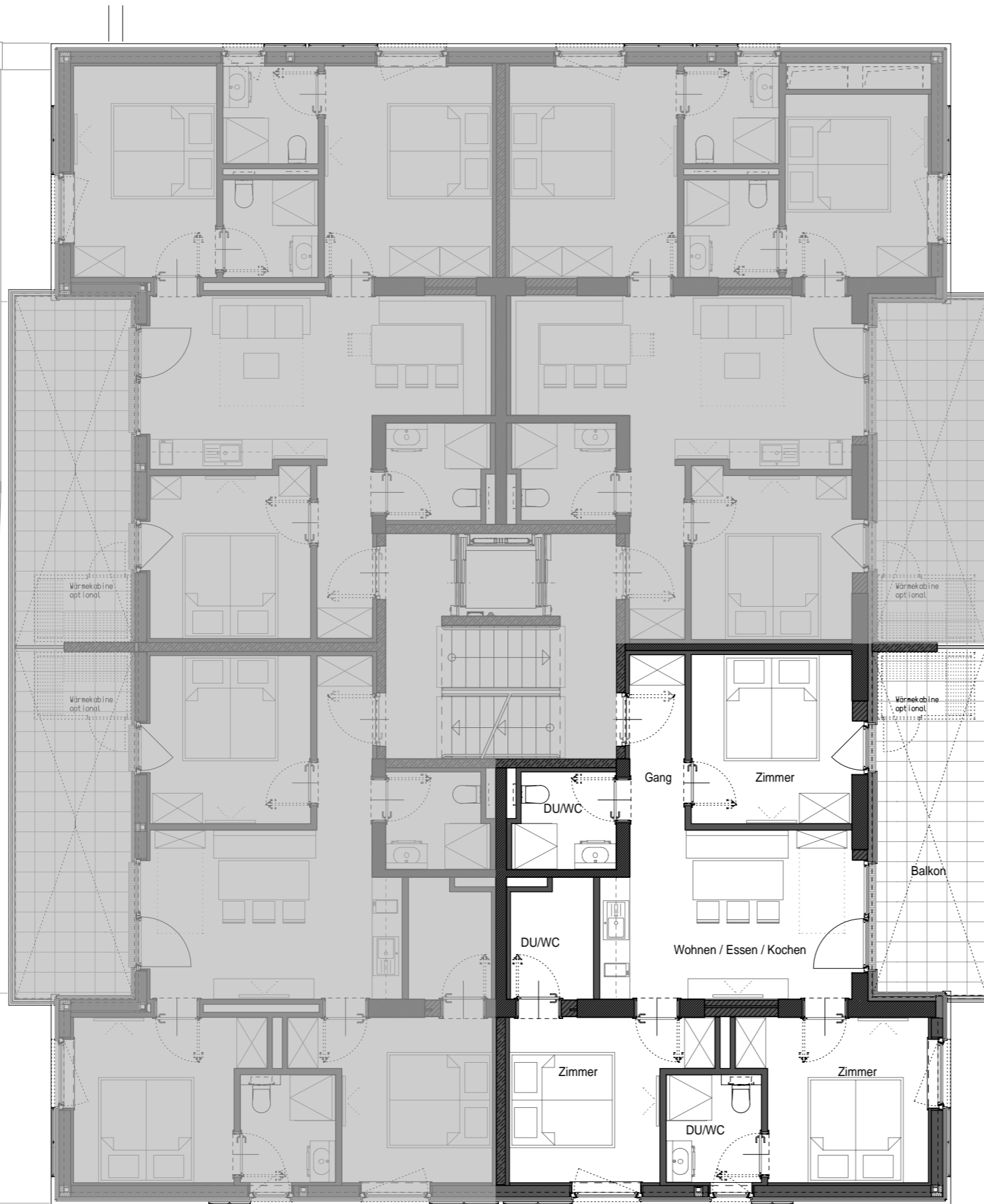
Grundriss Haus 3 E+2 M 1:100